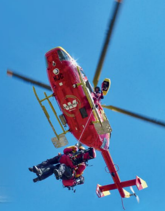
Westpac Rescue Helicopter Christchurch