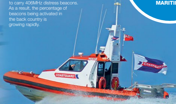
Coastguard New Zealand